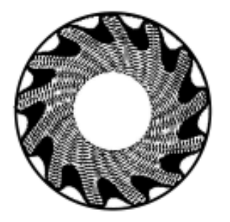
XTL @ 15 psid